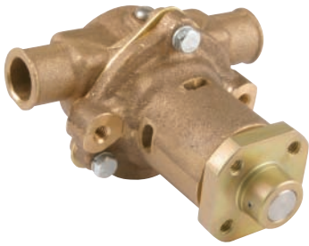
G30-2 & G30-2B