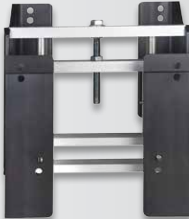
D2000 EZ-Adjust Manual Jack Plate