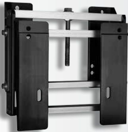
D1000 Side Locked Manual Jack Plate