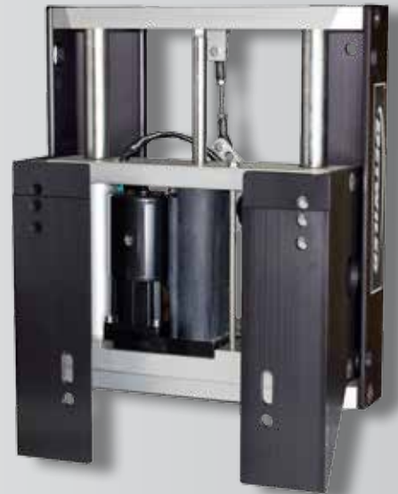
D3000 Hydraulic Jack Plate